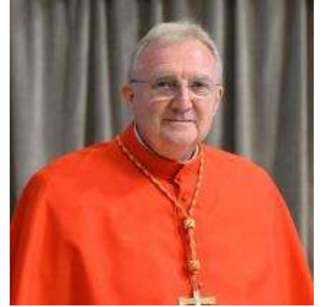
Cardinal Arthur Roche, Prefect of the Dicastery for Divine Worship and the Discipline of the Sacraments