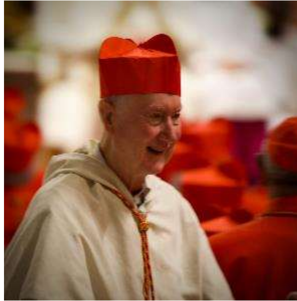
Cardinal Timothy Radcliffe, Dominican priest